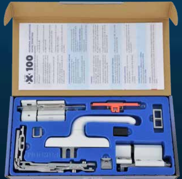
Complete package in a box

The X-100 tilt & turn mechanism is used in CAMERA EUROPEA aluminium profiles. Its parts are made of zamak and aluminium. Specifically: